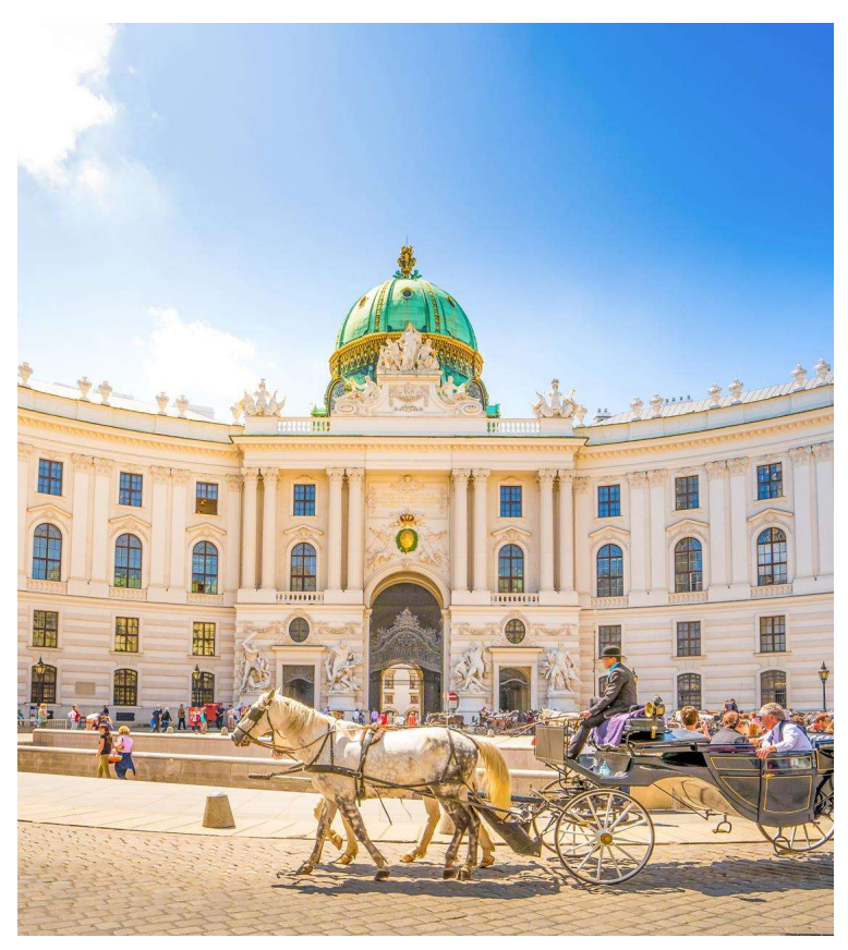
11 Days • 14 Meals: 9 Breakfasts, 1 Lunch, 4 Dinners

HIGHLIGHTS... Prague, Prague Castle, Cesky Krumlov, Vienna, Schönbrunn Palace, Classical Music Performance, Choice on Tour, Bratislava, Lunch with Locals, Budapest, Matthias Church, Fisherman's Bastion, Visegrad, Renaissance Dinner